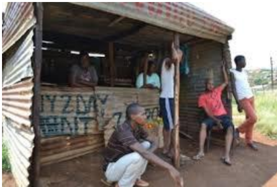
Dambuza unemployed youth

To highlight the plight of the community here are some pictures: