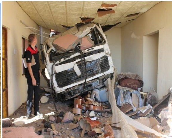
Water tanker that crashed into a home

Excellent partnership opportunity by NYDA for uMgungundlovu TVET and Elangeni TVET College as the partner to train the youth from kwaDambuza area and for the community to take ownership. A programme is the NYDA skill welding programme for water pipes. DAMCOM COMMUNITY CENTRE has been established to further assist kwaDambuza community