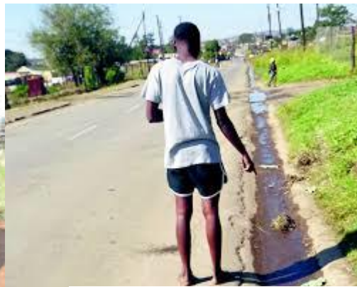
Plan to prevent Water wastage